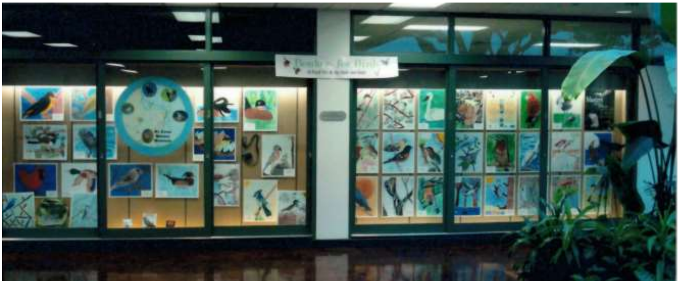
Bonkers for Birds Display at the Missouri Botanical Garden