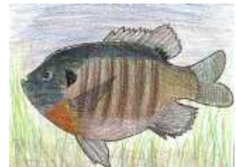
Fish Finatics Artwork

483 preschoolers - 2,950 students in 2017/2018 School Year 9,965 students since 2010