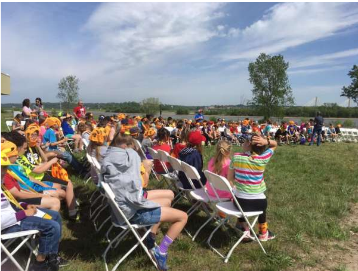
Every Kid in a Park Day